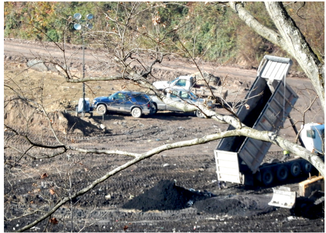
WETZEL COUNTY LANDFILL: DISPOSAL OF DRILL CUTTINGS

Landfills accepting drilling waste have not had their permits modified to account for new drilling-related pollutants at their primary effluent discharge. Therefore, monitoring at landfills may not reliably document impacts of drilling wastes.