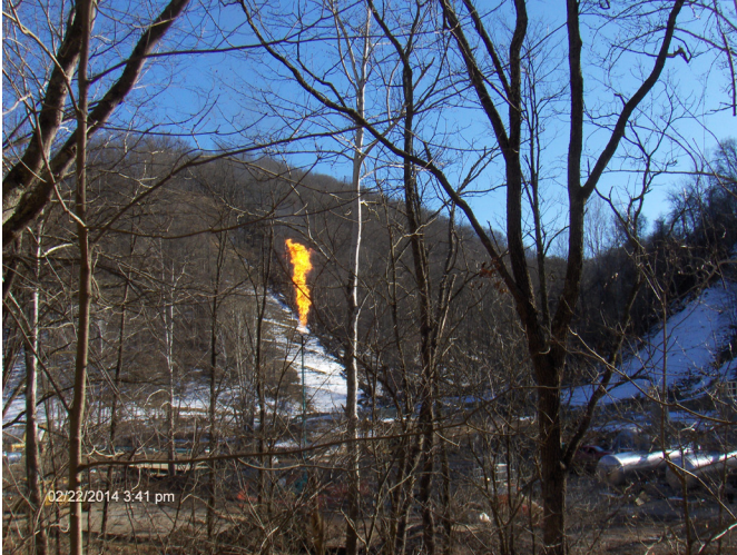
RAW GAS FLARING NEAR EQT PLANT IN MOBLEY, WV