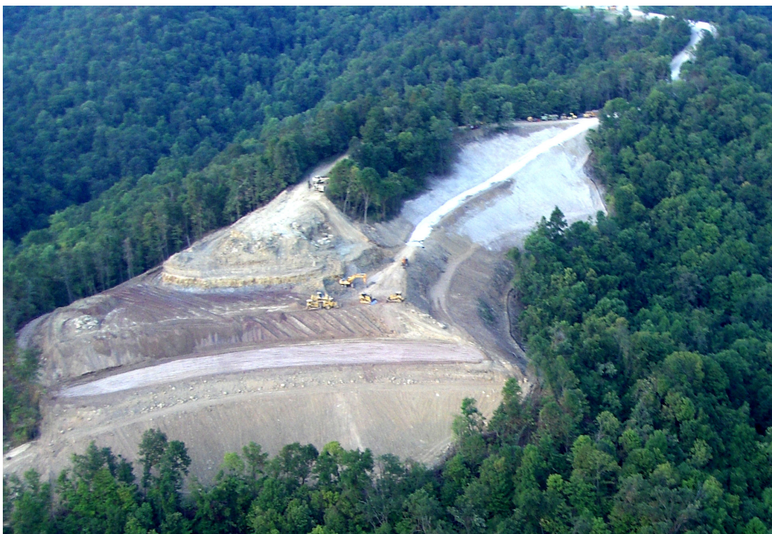
WELL PAD GRADING: SITE PREPARATION FOR STONE ENERGY BOYERS WELLPAD NEAR NEW MARTINSVILLE