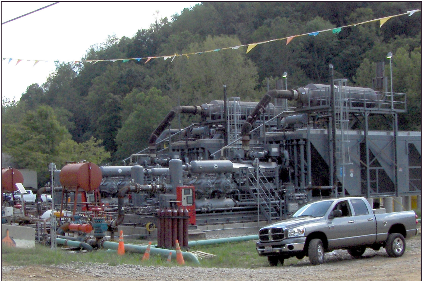
TEMPORARY COMPRESSOR STATION ADJACENT TO MARK WEST GAS PROCESSING PLANT IN MOBLEY, WV

Additionally, depending on the permit, parties with certain affected interests may file an appeal.