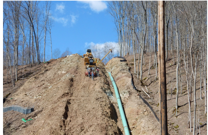
CONSTRUCTION OF OHIO VALLEY CONNECTOR: A 30 INCH NATURAL GAS PIPELINE IN WETZEL COUNTY

Projects disturbing one to less than three acres have a simplified option for meeting stormwater permitting requirements, including: