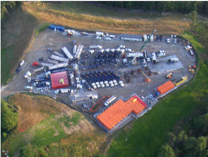
HYDRAULIC FRACTURING IN PROGRESS: STONE ENERGY'S BOWYERS WELL PAD IN WETZEL COUNTY, WV